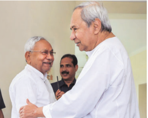
Bihar Chief Minister Nitin Kumar and his Odisha counterpart Naveen Patnaik, in Bhubaneswar on Tuesday

Kumar spoke of his "old relationship" with Patnaik and his legendary father Biju Patnaik. "We did not hold any political discussion. We have good relations, and there is no need to discuss politics," Kumar, scheduled to meet Jharkhand CM Hemant Soren and NCP chief Sharad Pawar later this week, said. An Opposition leaders' meeting