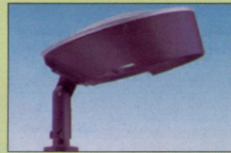
Luminaires complying with Green Building Lighting requirements

“Green building use less water, optimise energy utilization, conserve natural resources, generate less waste and provide healthier spaces for occupants, as compared to a conventional building.”