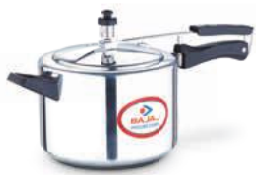
Capacity 2L Also available: - PCX 33 - 3L