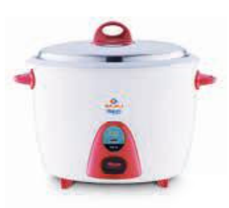
MAJESTY RCX 28