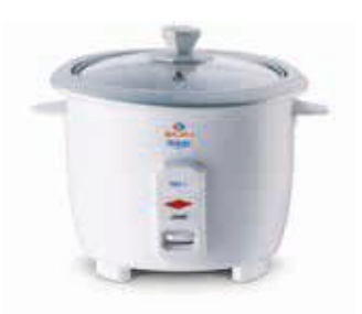
MAJESTY RCX 1 MINI